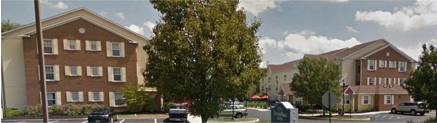
CURRENT STREET VIEW